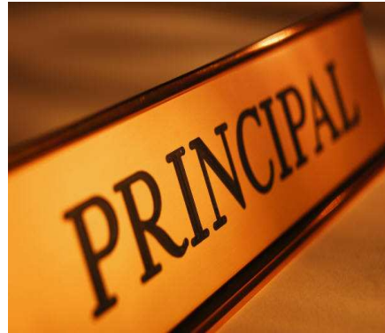
Work hard, get smart, graduate from college!

her scholars will eventually make it to college, graduate, and have a tremendous career.